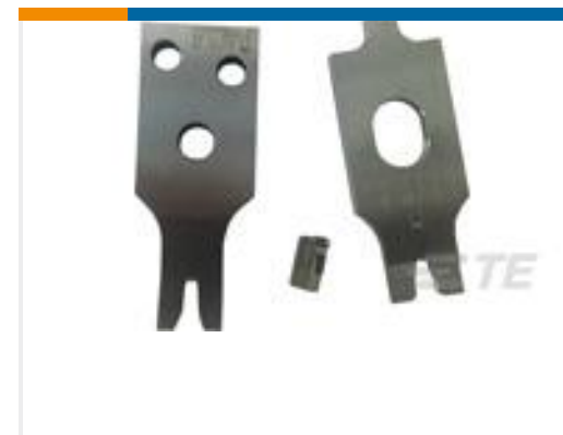
TE Part #7-2150081-7 OCEAN_2.0_SPARE_PART_KIT- 090F130F