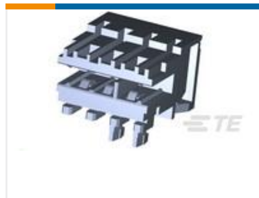
TE Part #2-1534796-3 AMP DUOPLUG MK2 CONNECTOR 3P