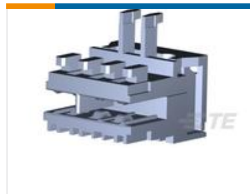
TE Part #6-1534796-3 AMP DUOPLUG MK2 CONNECTOR 3P