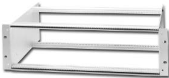
CCK 160-3U: Guides not included in cage part number

Din Based Subrack Types by Part Number Stem: