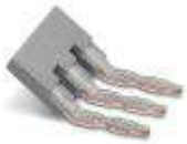
Insertion bridge, Number of positions: 3, Color: gray