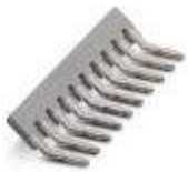
Insertion bridge, Number of positions: 10, Color: gray