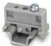
End clamp, width: 6.2 mm, color: gray