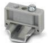
End clamp, width: 6.2 mm, color: gray