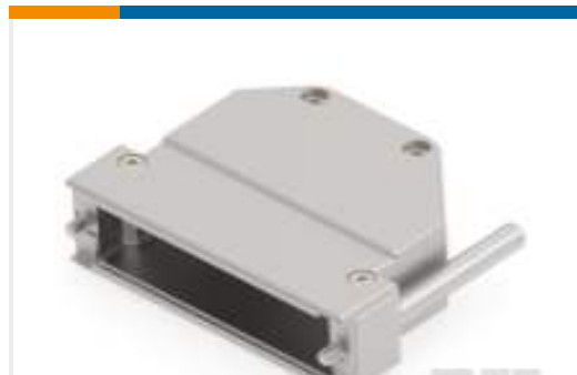
TE Part #1-2308345-5 FULL METAL HOODS SIZE 4 - 5 (RAW)