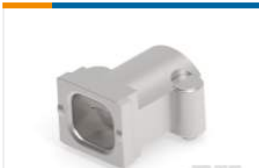
TE Part #1-2308272-1 CABLE CLAMPS (CASE RAW)