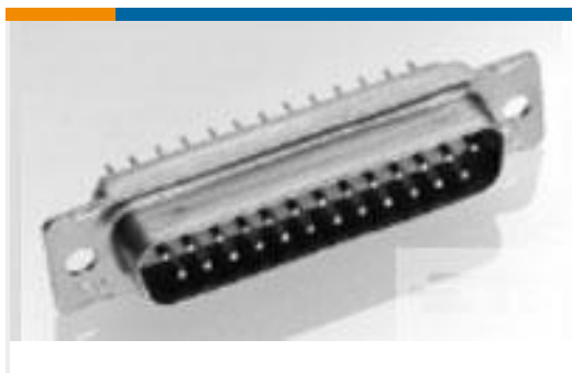
TE Part #1757819-4 AMPLIMATE,ASY,PLUG,STD,109,ZN,4