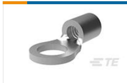
TE Part #32859-1 BUDGET,RING,26-22,8,UNPLTD