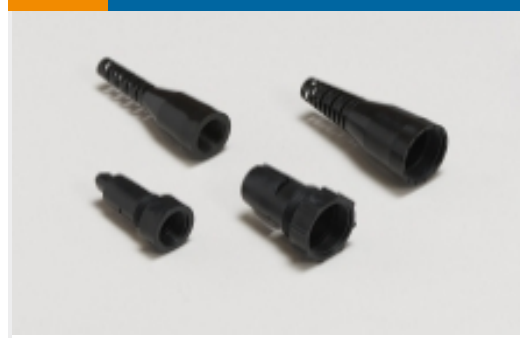
Connector Strain Relief(53)