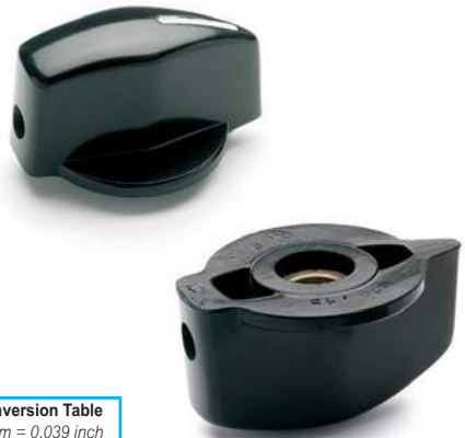
Conversion Table 1 mm = 0.039 inch