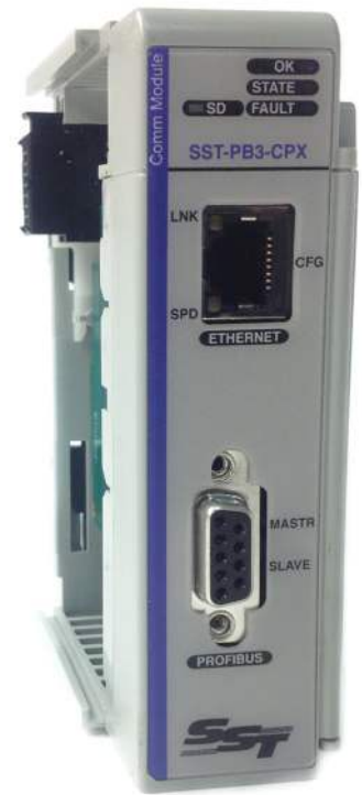
SST™-PB3-CPX PROFIBUS* Master/Slave Module