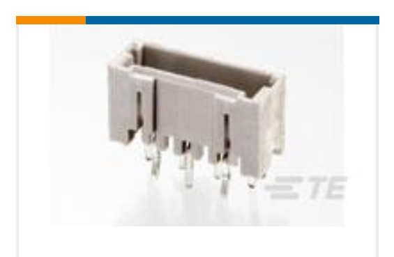
TE Part #292207-7 MINI CT SGL DIP V 7P NAT