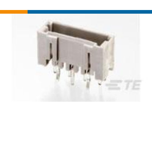
TE Part #292207-4 MINI CT SGL DIP V 4P NAT