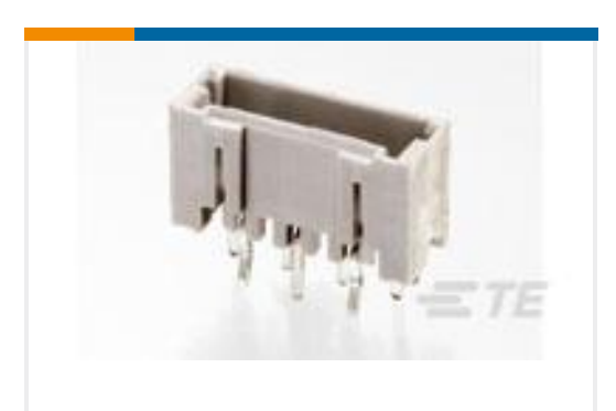
TE Part #292207-8 MINI CT SGL DIP V 8P NAT