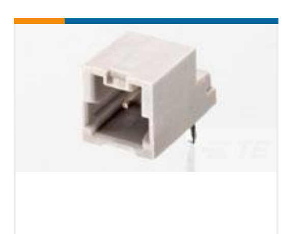
TE Part #292206-5 MINI CT SGL DIP H 5P NAT