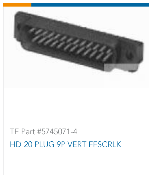
TE Part #5745071-4 HD-20 PLUG 9P VERT FFSCRLK