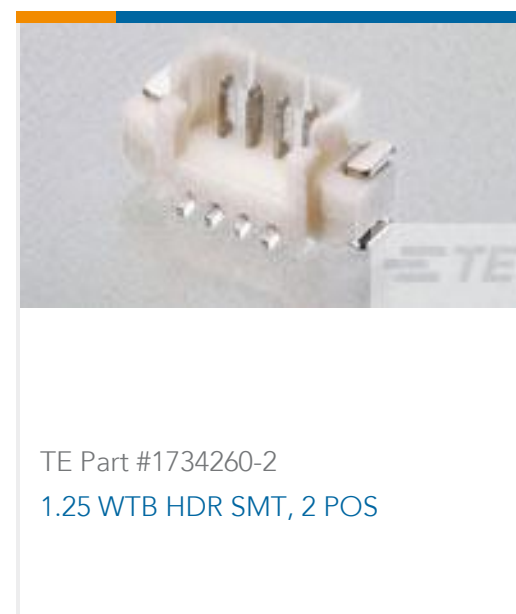
TE Part #1734260-2 1.25 WTB HDR SMT, 2 POS