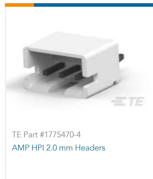
TE Part #1775470-4 AMP HPI 2.0 mm Headers