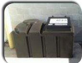
Cooking Oil Recycling