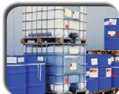
Diesel Exhaust Fluid