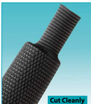
Cut Cleanly Scissor