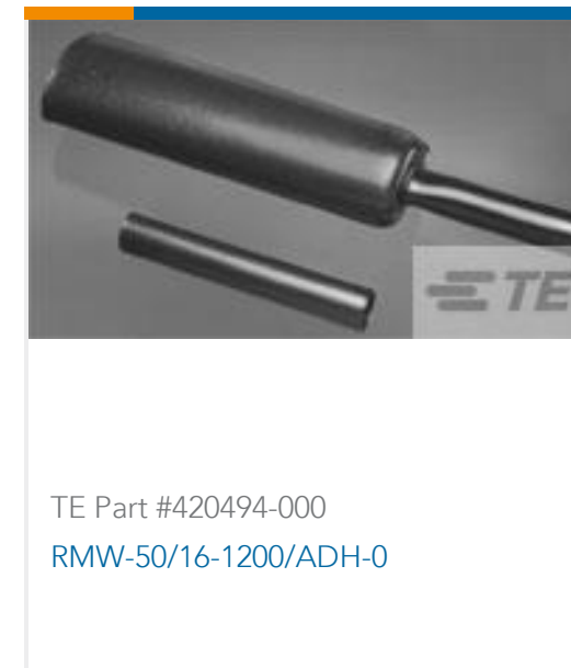
TE Part #420494-000 RMW-50/16-1200/ADH-0