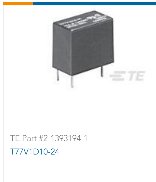
TE Part #2-1393194-1 T77V1D10-24