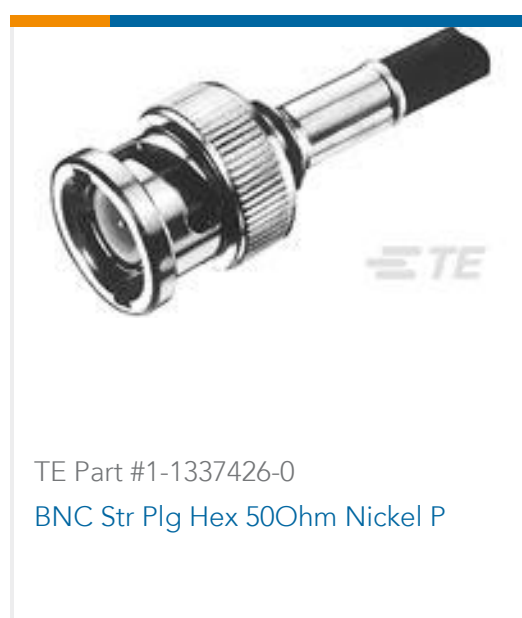
TE Part #1-1337426-0 BNC Str Plg Hex 50Ohm Nickel P