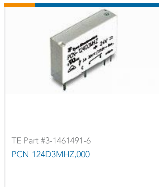
TE Part #3-1461491-6 PCN-124D3MHZ,000