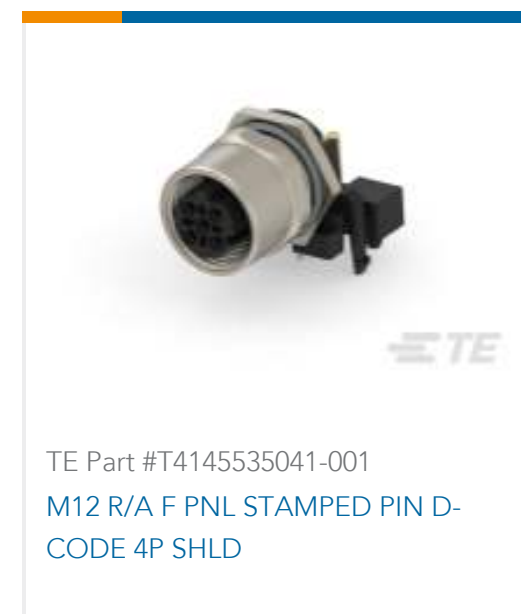
TE Part #T4145535041-001 M12 R/A F PNL STAMPED PIN D- CODE 4P SHLD