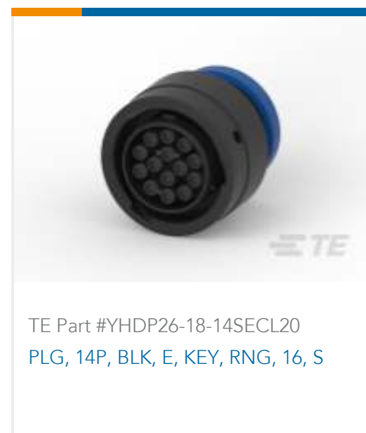
TE Part #YHDP26-18-14SECL20 PLG, 14P, BLK, E, KEY, RNG, 16, S