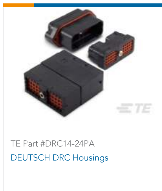
TE Part #DRC14-24PA DEUTSCH DRC Housings