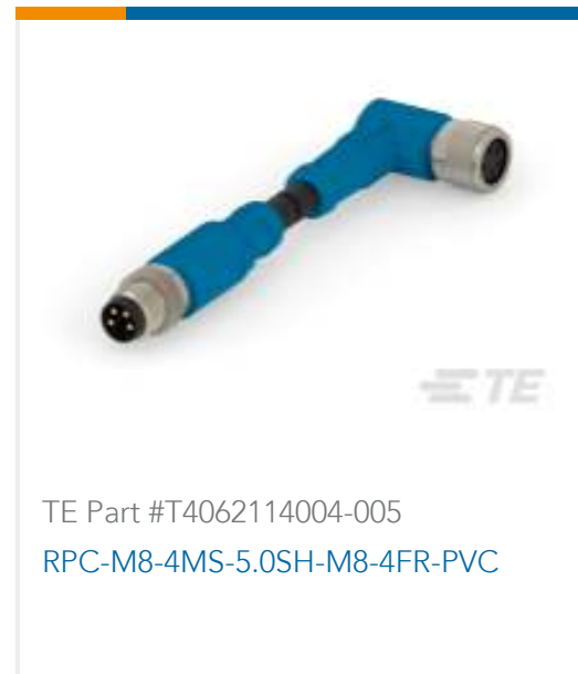
TE Part #T4062114004-005 RPC-M8-4MS-5.0SH-M8-4FR-PVC