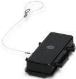
HEAVYCON protective cover, B16, for HC-EVO-B16... supporting base element, for double locking latch, with retaining cord with combination eyelet, IP54

Please be informed that the data shown in this PDF Document is generated from our Online Catalog. Please find the complete data in the user's documentation. Our General Terms of Use for Downloads are valid ( http://phoenixcontact.com/download )