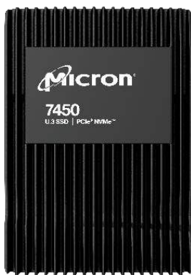
U.3: 7mm and 15mm

Designed as a mainstream solution, the 7450 SSD balances performance and density. Our offering includes a PCIe Gen4, M.2, 22 x 80mm with power-loss protection 4 and a 7.68TB E1.S that delivers industry-leading capacity. 5