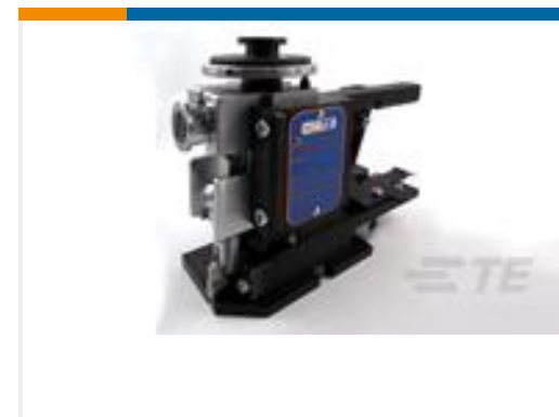
TE Part #2150081-1 OCEAN_2.0_APPLICATOR-E-090F130F