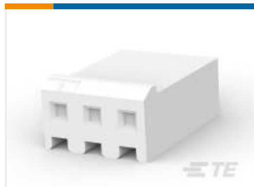
TE Part #770849-7 Receptacle Housing: Wire-to-Board, with Mating Alignment, SL156