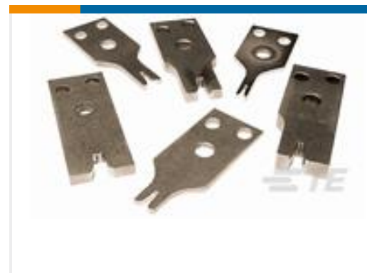
TE Part #2-456405-5 CRIMP, WIRE (.080F X .158THK)