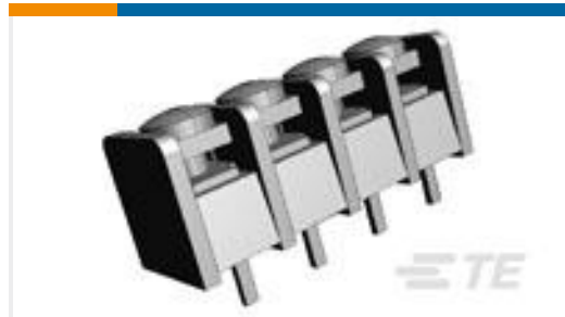
TE Part #2-1437667-6 4DB-P108-04=4DB ASSEMBLY