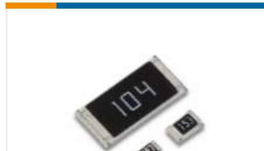
TE Part #4-2176349-4 CRGCO 2512 39K 1%