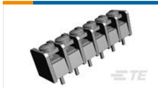
TE Part #2-1437667-9 4DB-P108-06=4DB ASSEMBLY