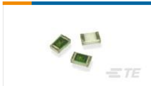
TE Part #2176088-2 RP 1J 0.166W 768R 0.1% 25PPM 1K RL