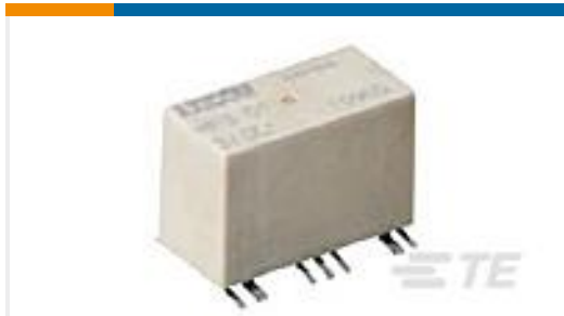
TE Part #1462051-1 HF351=50OHM140MW 3V MONO