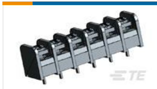
TE Part #3-1437664-8 NC6-P108-06=NC6 ASSEMBLY