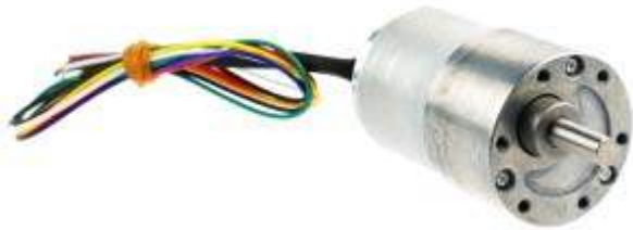
12V DC Motor 122rpm w/Encoder (SKU: FIT00403)