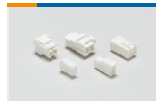
Rectangular Power Connectors(70)