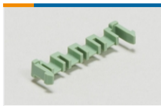
PCB Latches, Locks &amp; Retainers(7)