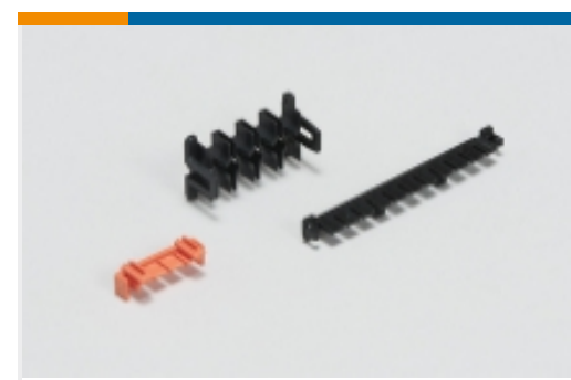
Rectangular Connector Locking(8)