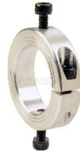
*Additional hardware #01 included