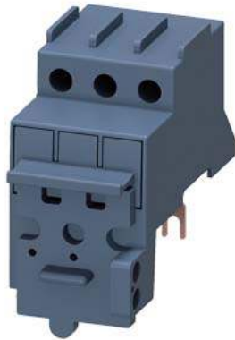
Disconnecter module for circuit breaker Size S00/S0