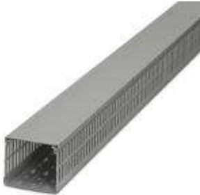
Cable duct, gray, comprising upper part and mounting base, width: 80 mm, height: 40 mm, length: 2000 mm

Please be informed that the data shown in this PDF Document is generated from our Online Catalog. Please find the complete data in the user's documentation. Our General Terms of Use for Downloads are valid ( http://phoenixcontact.com/download )