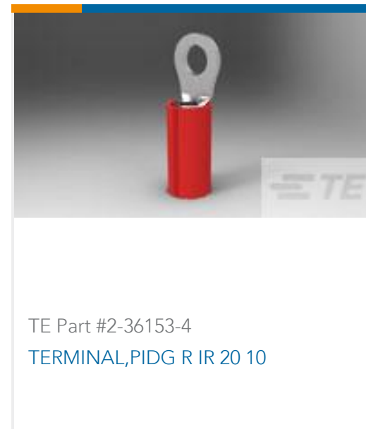
TE Part #2-36153-4 TERMINAL,PIDG R IR 20 10