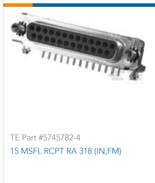
TE Part #5745782-4 15 MSFL RCPT RA 318 (IN,FM)