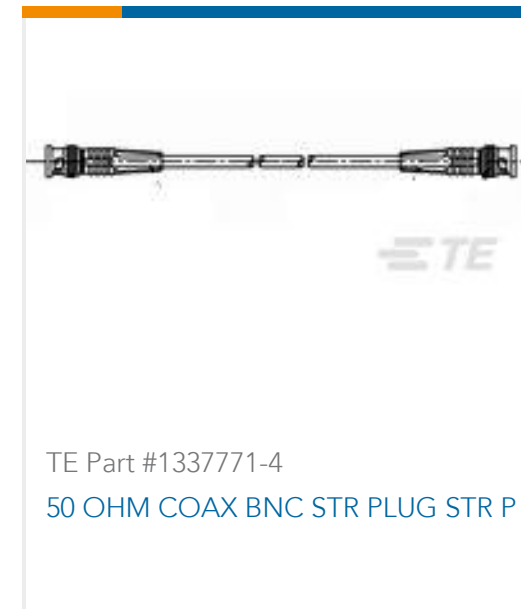
TE Part #1337771-4 50 OHM COAX BNC STR PLUG STR P