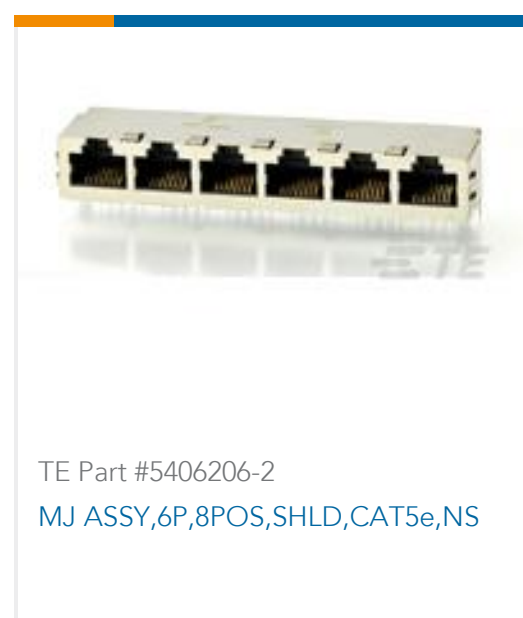
TE Part #5406206-2 MJ ASSY,6P,8POS,SHLD,CAT5e,NS