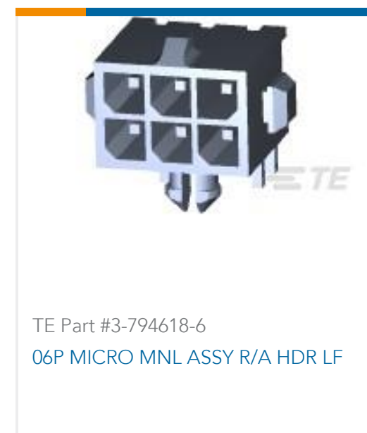
TE Part #3-794618-6 06P MICRO MNL ASSY R/A HDR LF