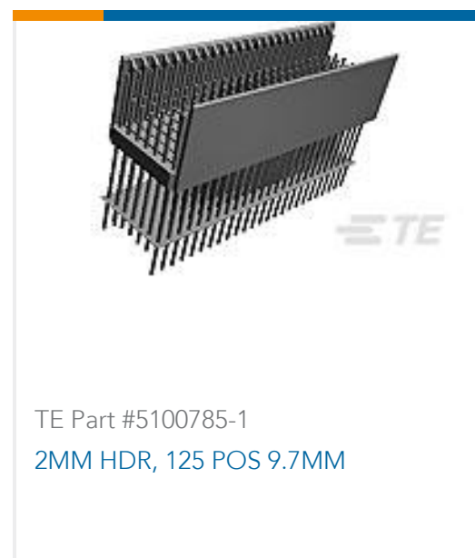
TE Part #5100785-1 2MM HDR, 125 POS 9.7MM