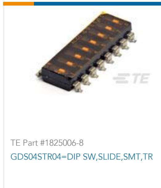
TE Part #1825006-8 GDS04STR04=DIP SW,SLIDE,SMT,TR