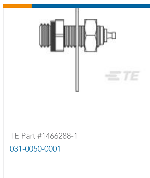
TE Part #1466288-1 031-0050-0001