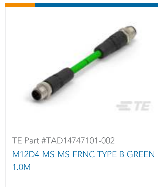
TE Part #TAD14747101-002 M12D4-MS-MS-FRNC TYPE B GREEN-1.0M