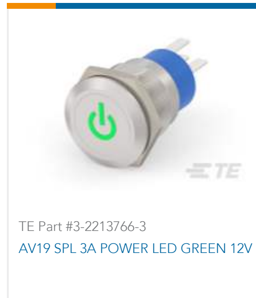
TE Part #3-2213766-3 AV19 SPL 3A POWER LED GREEN 12V