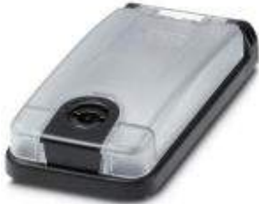
Mounting frame for one front plate/socket, frame: black, cover: transparent, closed with 3 mm two-way key bit.

Please be informed that the data shown in this PDF Document is generated from our Online Catalog. Please find the complete data in the user's documentation. Our General Terms of Use for Downloads are valid ( http://phoenixcontact.com/download )