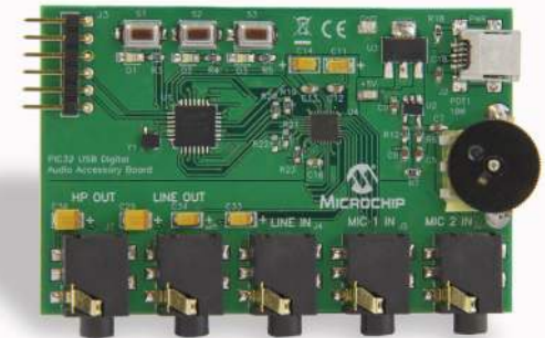
FIGURE 1: PIC32 USB DIGITAL AUDIO ACCESSORY BOARD