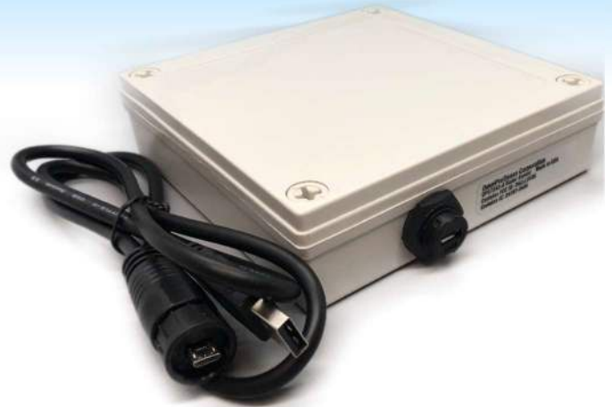
OPS7242 Radar Sensor