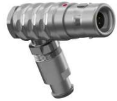
POSITIONS: 8 positions