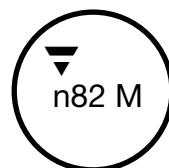
HGZ 330 pF to 2.2 nF