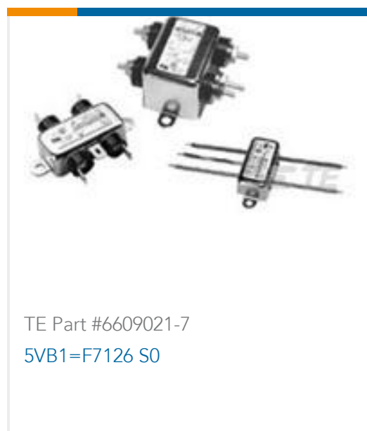
TE Part #6609021-7 5VB1=F7126 S0