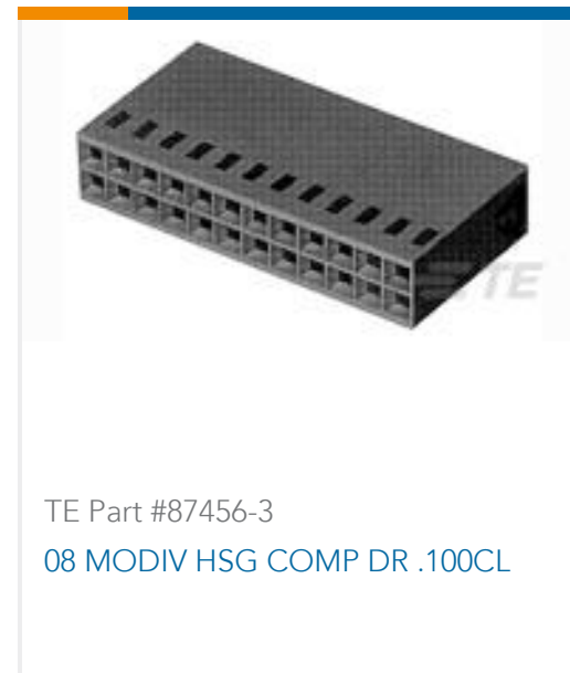
TE Part #87456-3 08 MODIV HSG COMP DR .100CL