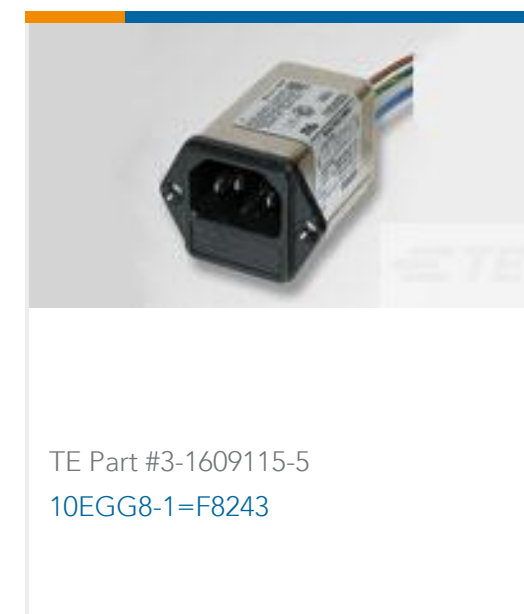
TE Part #3-1609115-5 10EGG8-1=F8243