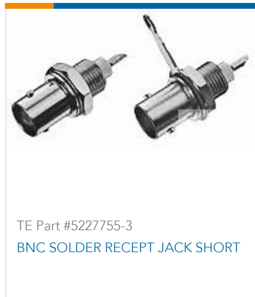
TE Part #5227755-3 BNC SOLDER RECEPT JACK SHORT