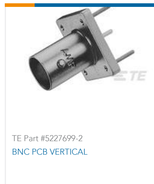
TE Part #5227699-2 BNC PCB VERTICAL