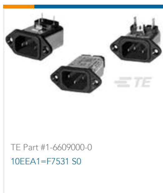
TE Part #1-6609000-0 10EEA1=F7531 S0