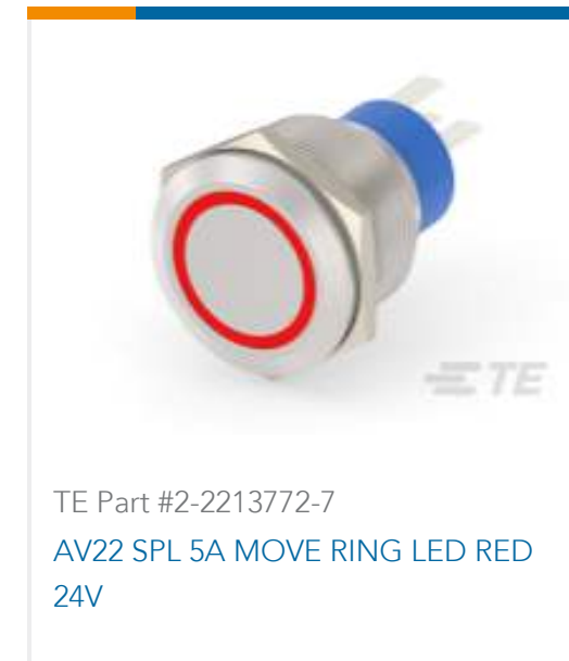
TE Part #2-2213772-7 AV22 SPL 5A MOVE RING LED RED 24V