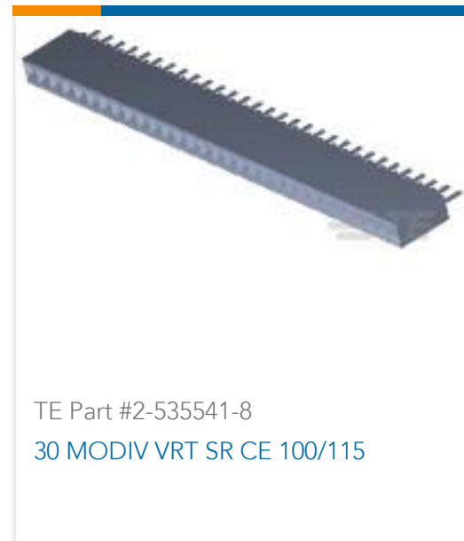
TE Part #2-535541-8 30 MODIV VRT SR CE 100/115