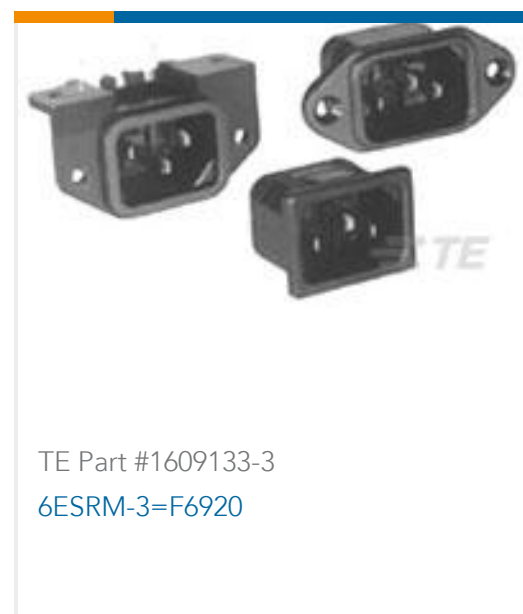
TE Part #1609133-3 6ESRM-3=F6920