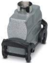
HEAVYCON B16 coupling housing, with double locking latch, height: 82 mm, with 1 x M32 gland, straight cable outlet

Please be informed that the data shown in this PDF Document is generated from our Online Catalog. Please find the complete data in the user's documentation. Our General Terms of Use for Downloads are valid ( http://download.phoenixcontact.com )