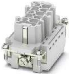
HEAVYCON socket insert, for 830 V (III/3), with 3 N/O contacts and 2 switch contacts, crimp connection

Please be informed that the data shown in this PDF Document is generated from our Online Catalog. Please find the complete data in the user's documentation. Our General Terms of Use for Downloads are valid ( http://phoenixcontact.com/download )