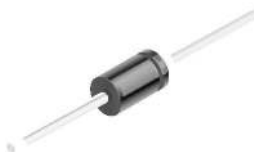
DO-41 Glass case COLOR BAND DENOTES CATHODE