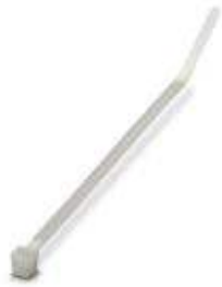
Cable tie, dimensions: L x W, 290 x 4.8 mm, color: transparent

Please be informed that the data shown in this PDF Document is generated from our Online Catalog. Please find the complete data in the user's documentation. Our General Terms of Use for Downloads are valid ( http://download.phoenixcontact.com )