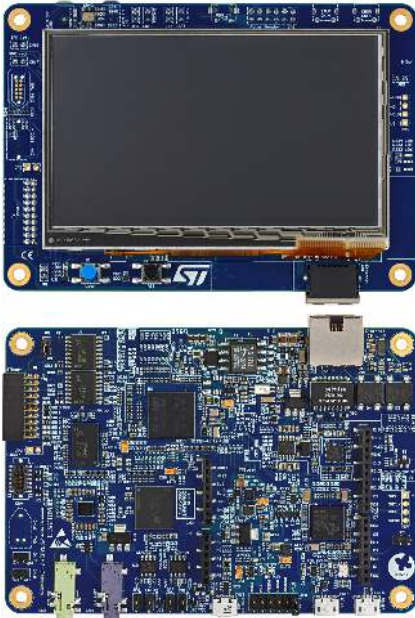
Board top and bottom views. Pictures are not contractual. PCB colors may differ.