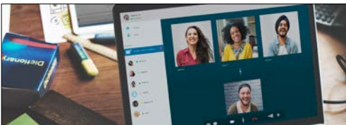
5G Networking/Telecommunications Communication Modules (WiFi Routers and Mesh Devices)