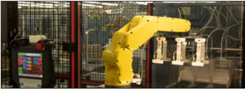
Industrial IoT / Robotics & Factory Automation