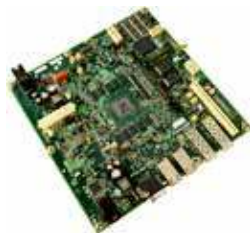
QorIQ Qonverge BSC9132 Development Board