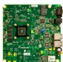
QorIQ Qonverge BSC9131 Reference Design Board

The QorIQ Qonverge line of products has a proven set of hardware and software tools for code development and debug. The CodeWarrior Development Studio is a comprehensive integrated development environment (IDE) that provides a highly visual and automated framework to accelerate the development of the most complex embedded applications. The CodeWarrior tools allow a consistent look and feel for developing code on both cores as opposed to competing solutions that may require multiple debugging platforms. In addition to the IDE, the BSC9131RDB and BSC9132QDS give you the ability to develop and test code on hardware systems before developing your own hardware solution.