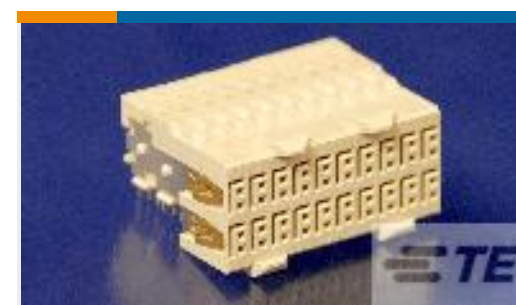
TE Part #6469028-1 HM-ZD 2PR RECP 40P