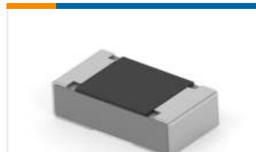
TE Part #3-2176480-0 RA73F 1J 1K1 0.1% 5K RL