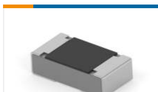
TE Part #6-2176481-0 RA73F 1J 24K3 0.1% 5K RL