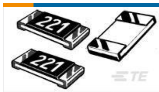
TE Part #3-2176070-9 3521 390R 1% 2W