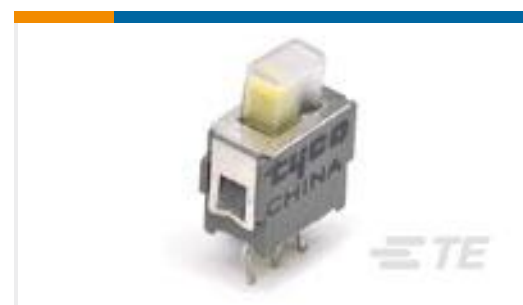
TE Part #1825032-1 SE1DGPC04=SEALED SLIDE SWITCH