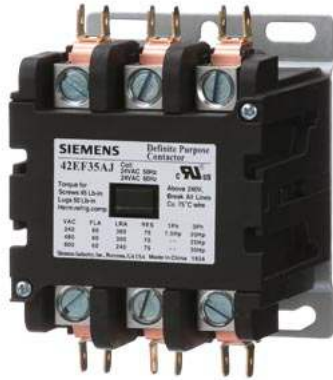
Contactor, 42DP,60A,3P,Open,277 Contactor, 42DP,60A,3P,Open,277