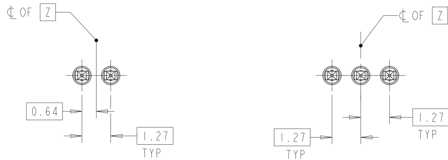
BASIC DIMENSIONS FOR ODD NO OF SPACES (SEE TABLE)