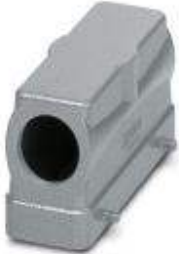
HEAVYCON B24 sleeve housing, for double locking latch, height: 65 mm, with 1 x M25 thread, lateral cable outlet

Please be informed that the data shown in this PDF Document is generated from our Online Catalog. Please find the complete data in the user's documentation. Our General Terms of Use for Downloads are valid ( http://phoenixcontact.com/download )