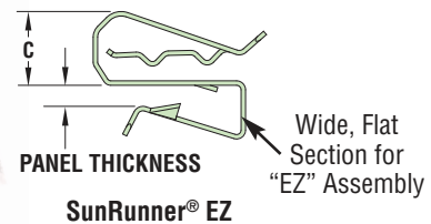
SunRunner® EZ with (optional) UL Approved SunBundler (page 1-11) looped through slot