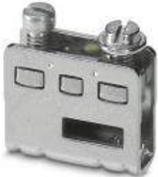
Branch terminal, Connection method Screw connection, Cross section: 0.5 mm 2 - 16 mm 2 , Width: 7.7 mm, Color: gray

Please be informed that the data shown in this PDF Document is generated from our Online Catalog. Please find the complete data in the user's documentation. Our General Terms of Use for Downloads are valid ( http://download.phoenixcontact.com )