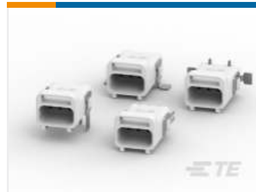
TE Part # CAT-SL36-M6642B Miniature Headers, SlimSeal