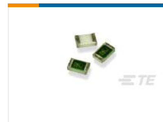
TE Part # 1614917-1 CPF0805 2K2 0.1% 25PPM 5K RL