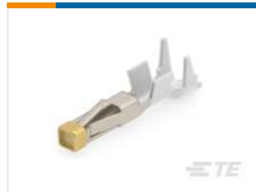
TE Part # 1-2834067-3 SOCKET CONTACT,MINIATURE WATERPROOF CONN