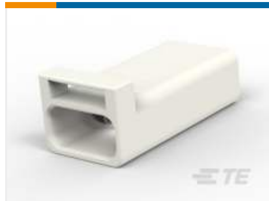
TE Part # 1-2834075-2 2P REC, MINIATURE WATERPROOF CONN.WHITE