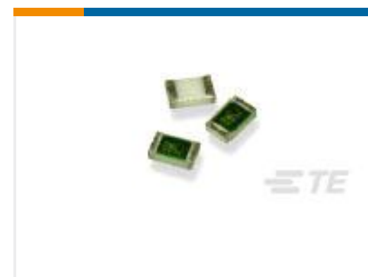
TE Part # 2-1614883-3 CPF 0805 10R 0.1% 25PPM 5K RL