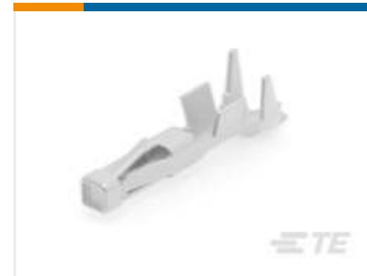
TE Part # 1-2834067-2 SOCKET CONTACT,MINIATURE WATERPROOF CONN