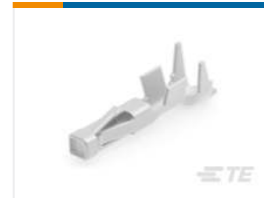
TE Part # 2-2834067-2 SOCKET CONTACT,MINIATURE WATERPROOF CONN