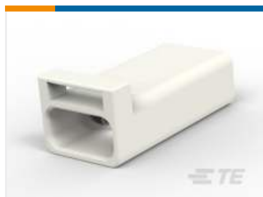
TE Part # 1-2834075-2 2P REC, MINIATURE WATERPROOF CONN.WHITE