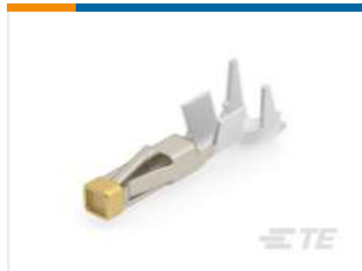
TE Part # 2-2834067-3 SOCKET CONTACT,MINIATURE WATERPROOF CONN