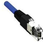
Without Pull Tab PNs 2159683/684