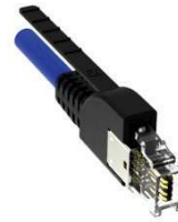
With Pull Tab PNs 2100356/357 PNs 2142758/759