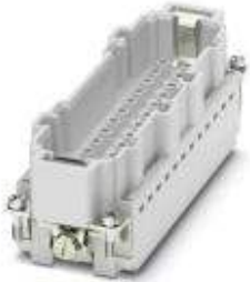
HEAVYCON pin insert, for 830 V (III/3), with 10 N/O contacts and 2 switch contacts, crimp connection

Please be informed that the data shown in this PDF Document is generated from our Online Catalog. Please find the complete data in the user's documentation. Our General Terms of Use for Downloads are valid ( http://phoenixcontact.com/download )