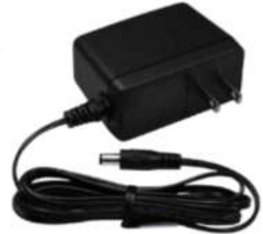
*Product images are for illustrative purposes only and may vary from actual design.