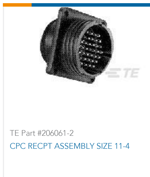
TE Part #206061-2 CPC RECEPT ASSEMBLY SIZE 11-4