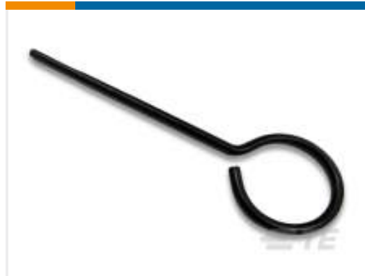
TE Part # 200893-2 INSERTION TOOL CONT