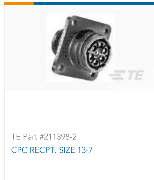
TE Part #211398-2 CPC RECEPT. SIZE 13-7