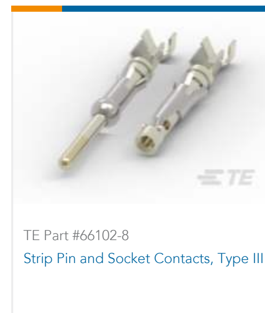
TE Part #66102-8 Strip Pin and Socket Contacts, Type III