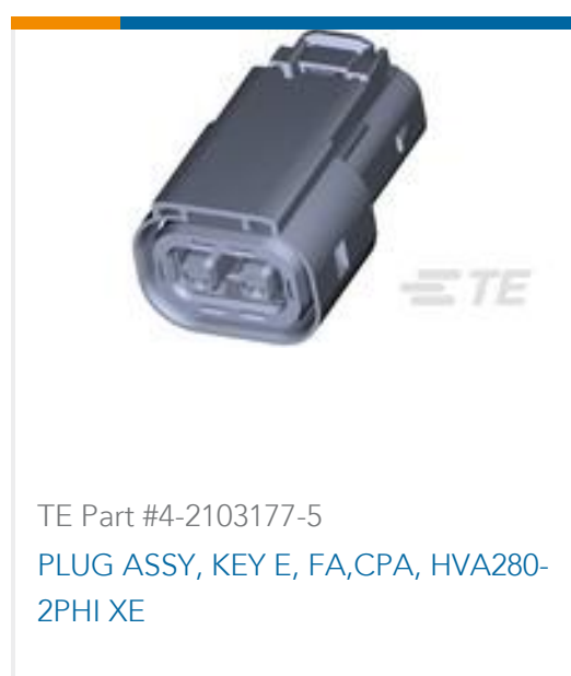
TE Part #4-2103177-5 PLUG ASSY, KEY E, FA,CPA, HVA280- 2PHI XE