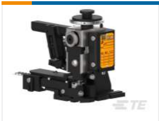
TE Part # 2151101-1 OCEAN_2.0_APPLICATIONER-S-090F120O