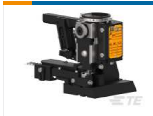
TE Part # 2-2151101-1 OCEAN_2.0_APPLICATIONER-S-090F120O