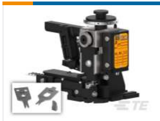
TE Part # 7-2151101-1 OCEAN_2.0_APPLICATIONER-S-090F120O