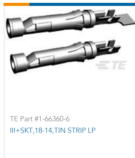
TE Part #1-66360-6 III+SKT,18-14,TIN STRIP LP