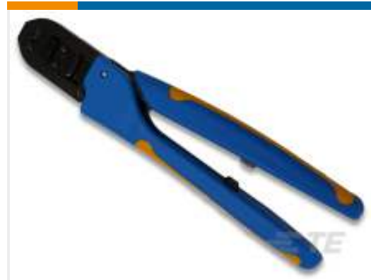
TE Part # 91519-1 CCII TYPE III+ PIN SKT 18-14 ASSY