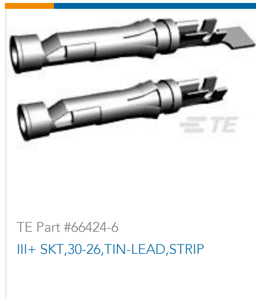
TE Part #66424-6 III+ SKT,30-26,TIN-LEAD,STRIP