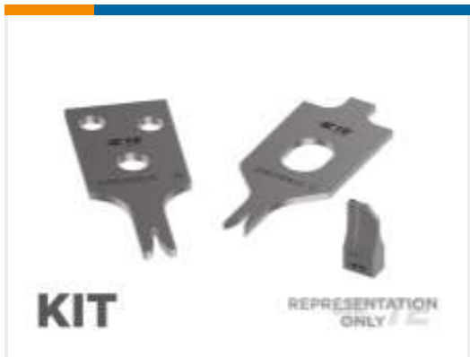
TE Part # 7-2151101-7 OCEAN_2.0_SPARE_PART_KIT-090F120O