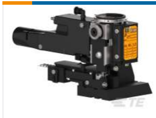
TE Part # 2-2151101-2 OCEAN_2.0_APPLICATIONER-S-090F120O