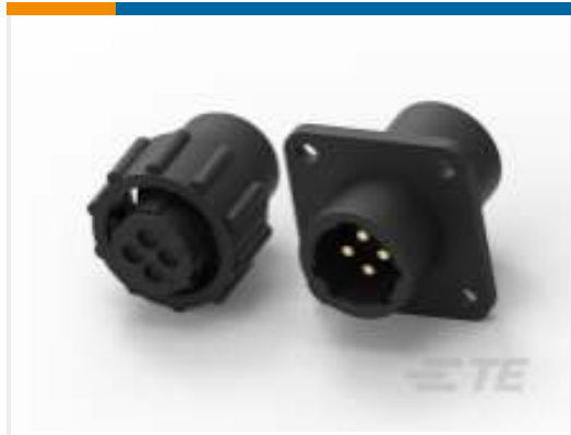
TE Part # CAT-AM71-C83998J Cable/Panel Mount Connector, CPC Series 1