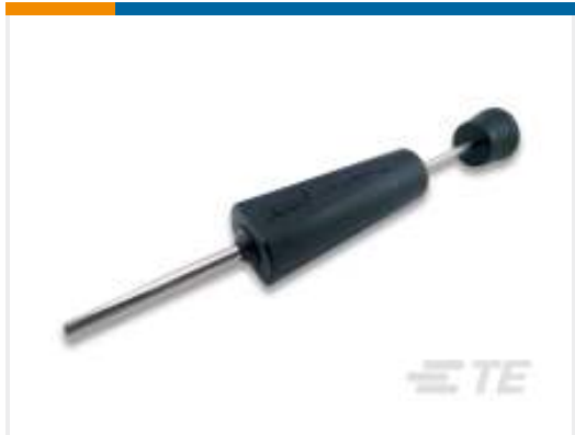
TE Part # 305183 EXTRACT TOOL TYPE 2 20-16