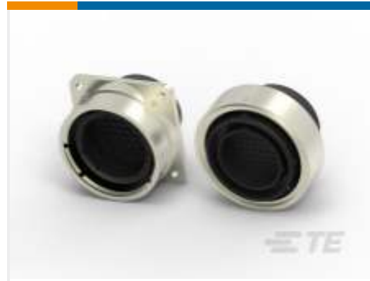
TE Part # CAT-AM71-C83998C Circular Plastic Connector, CMC Series 1