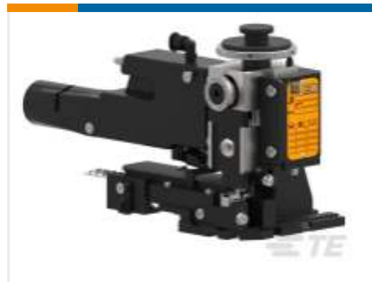
TE Part # 2151101-2 OCEAN_2.0_APPLICATIONER-S-090F120O