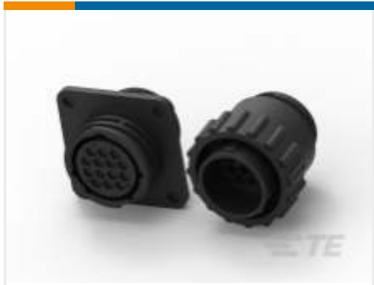
TE Part # CAT-AM71-C83998K Circular Connector, Environmentally Sealed, CPC Series 6