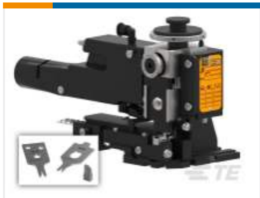
TE Part # 7-2151101-2 OCEAN_2.0_APPLICATIONER-S-090F120O