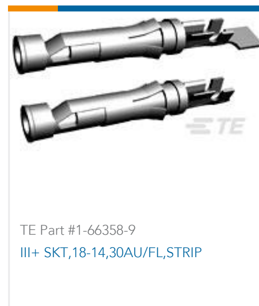
TE Part #1-66358-9 III+ SKT,18-14,30AU/FL,STRIP