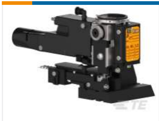
TE Part # 2-2151102-2 OCEAN_2.0_APPLICATIONER-S-046F059F