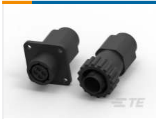
TE Part # CAT-AM71-C83998Y One-Piece Connector, Sealed, CPC Series 1