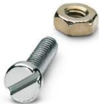
Screw, for attaching cable lugs to FAME test plugs, with cover, without test point, length: 4.5 mm, height: 4.5 mm, color: silver/black

https://www.phoenixcontact.com/us/products/3069467