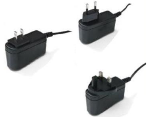
*Product images are for illustrative purposes only and may vary from actual design.