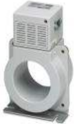
Residual current converter for type B+ residual current monitor.

Please be informed that the data shown in this PDF Document is generated from our Online Catalog. Please find the complete data in the user's documentation. Our General Terms of Use for Downloads are valid ( http://phoenixcontact.com/download )