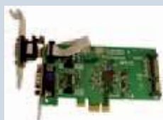
PX-801: LP PCIe 1+1xRS232 POS 1A SATA