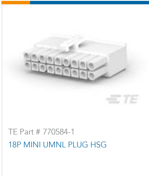
TE Part # 770584-1 18P MINI UMNL PLUG HSG