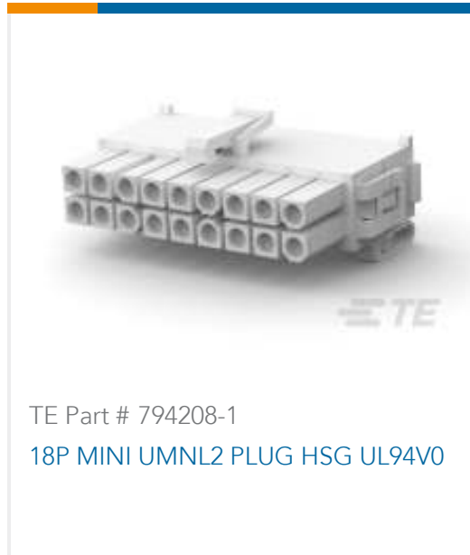
TE Part # 794208-1 18P MINI UMNL2 PLUG HSG UL94V0