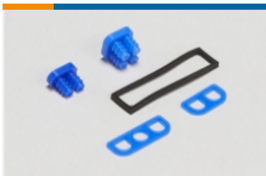
Rectangular Connector Seals(17)